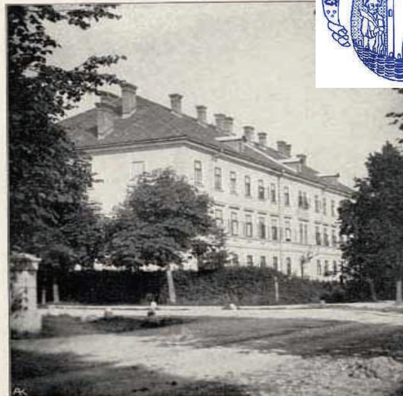
Mädchenerziehungsanstalt „Marienheim“ in Gottschee. Dekliško vzgojevališče „Marijin dom“ v Kočevju.